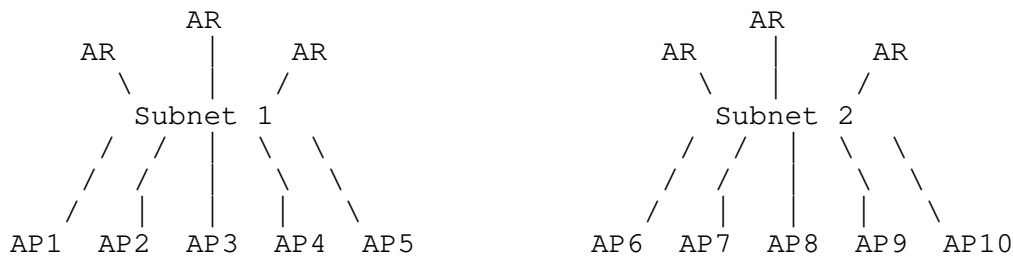
Figure 1. An 802.11 deployment with relay APs.

Figure 1 depicts a typical 802.11 deployment with two IP subnets, each with three Access Routers and five Access Points. Note that the APs in this figure are acting as link-layer relays, which means that they transport Ethernet-layer frames between the wireless medium and the subnet. Note that APs do not generally implement any particular spanning tree algorithm, yet are more sophisticated than simple bridges that would relay all traffic; only traffic addressed to STAs known to be associated on a given AP would be forwarded. Each subnet is on top of a single LAN or VLAN, and we assume in this example that APs 6-10 cannot reach the VLAN on which Subnet 1 is implemented. Note that a handover from AP1 to AP2 does not require a change of AR (here we assume the STA will be placed on the same VLAN during such a handoff) because all three ARs are link-layer reachable from an STA connected to any AP1-5. Therefore, such handoffs would not require IP-layer mobility management, although some IP-layer signaling may be required to determine that connectivity to the existing AR is still available. However, a handover from AP5 to AP6 would require a change of AR, because AP6 cannot reach the VLAN on which Subnet 1 is implemented and therefore the STA would be attaching to a different subnet. An IP-layer handover mechanism would need to be invoked in order to provide low-interruption handover between the two ARs.