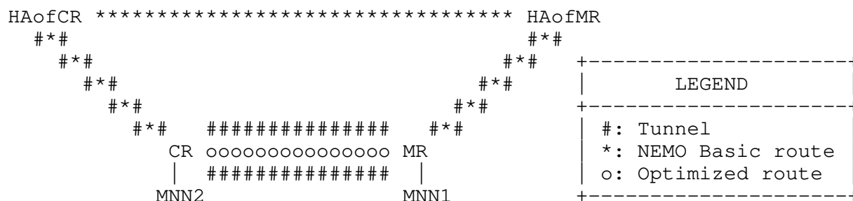
Figure 2: MR-MR Optimization

The definition of Correspondent Router does not limit it to be a fixed router. Here we consider the case where the Correspondent Router is a Mobile Router. Thus, Route Optimization is initiated and performed between a Mobile Router and its peer Mobile Router. Such solutions are often posed with a requirement to leave the Mobile Network Nodes untouched, as with the NEMO Basic Support protocol, and therefore Mobile Routers handle the optimization management on behalf of the Mobile Network Nodes. Thus, providing Route Optimization for a Visiting Mobile Node is often out of scope for such a scenario because such interaction would require extensions to the Mobile IPv6 protocol. This scenario is illustrated in Figure 2.